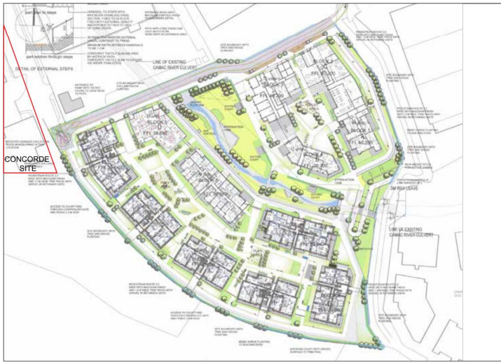
Marlet Development Site - Planning Application ref.: 2203/18