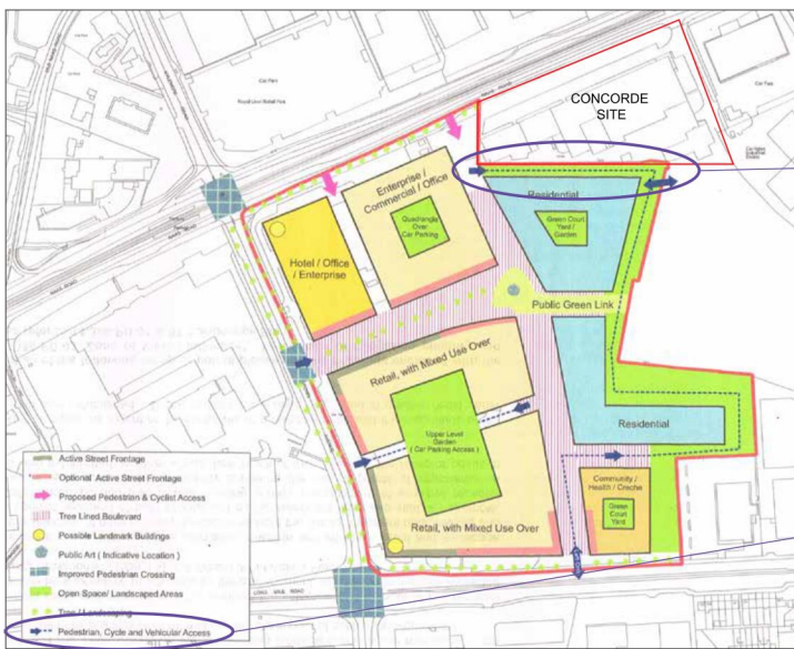
Map 5.9 Proposed Uses - Nissan Site Site - ref. page 66 of LAP